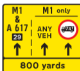
Lane restrictions at road works ahead