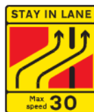
One lane crossover at contraflow road works