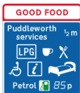
Motorway service area sign showing the operator's name