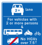
Vehicles permitted to use an HOV lane ahead